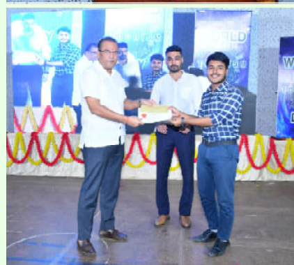
1 st prize winner of Elocution Competition among Colleges