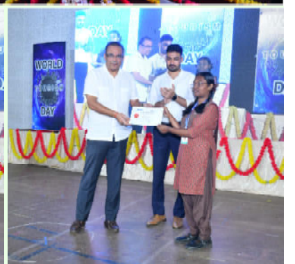
1 st prize winner of Painting Competition