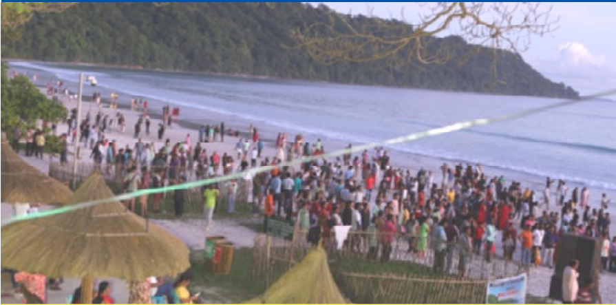
World Tourism Day celebration at Radhanagar Beach, Swaraj Dweep