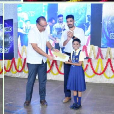
1 st prize winner of Elocution Competition among Schools